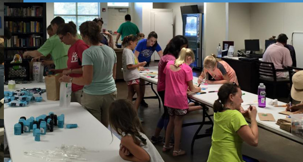
Left: The Family Mission Trip to Ferncliff Camp near Little Rock, Arkansas let participants learn about and help with the Presbyterian Disaster Assistance program.