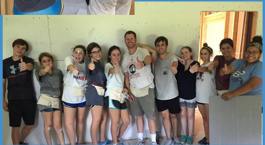
Above: The FPC Youth Mission Team served with Camp RHINO (Rebuilding Hope in New Orleans) working on construction June 13-18.