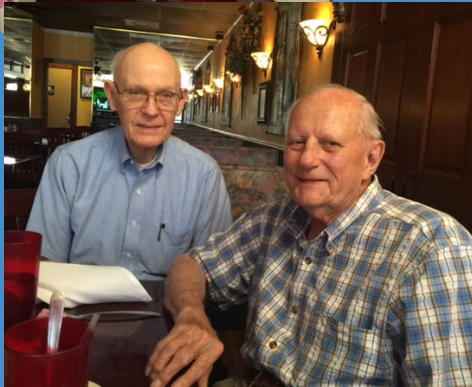
Above: The Beacons had fun on June 16 at their monthly lunch out.